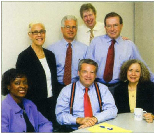
iCoachNewYork faculty and two recent graduates at an alumni gathering

Offered as a partnership of iCoachNewYork and Baruch College's Zicklin School of Business Leadership Initiative , PCP offers small class sizes and intensive involvement with faculty, guaranteeing a personalized professional development experience. Each participant finds his or her own voice as a coach through best-practice presentations, discussions, readings, and interaction with distinguished guest speakers. All these elements are brought together in a real coaching assignment supported by intensive individual supervision.